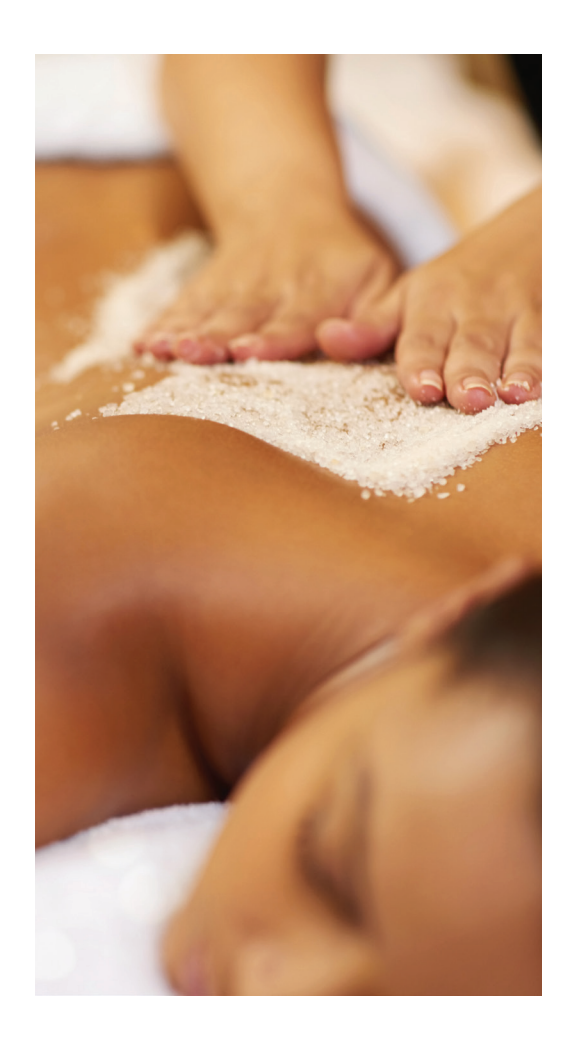
Can't find what you're looking for? Ask a spa concierge to help you design a package for the ideal spa day.