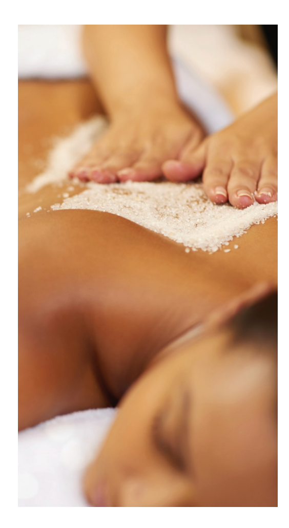
Can't find what you're looking for? Ask a spa concierge to help you design a package for the ideal spa day.